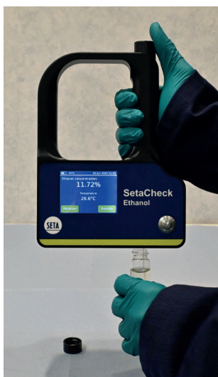
1) Take sample