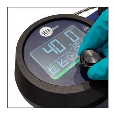
Select test temperature