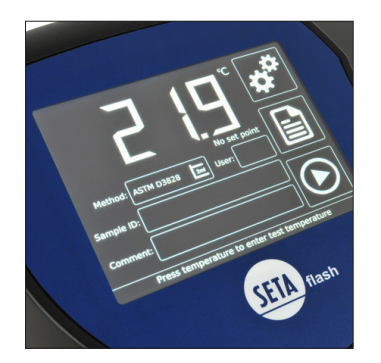
Select test temperature