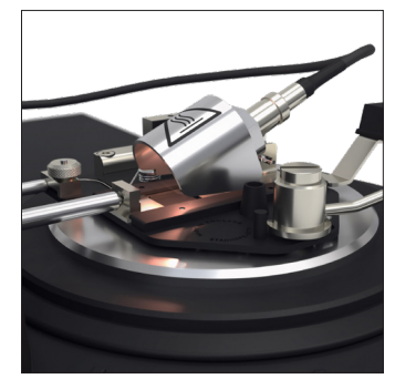
Automatic dip of ignition source and flash detection