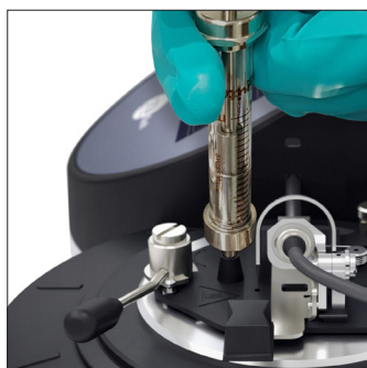
Inject 2ml sample