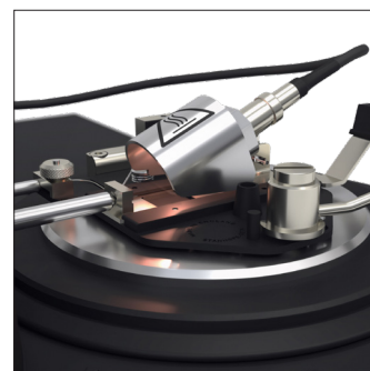
Automatic dip of ignition source and flash detection