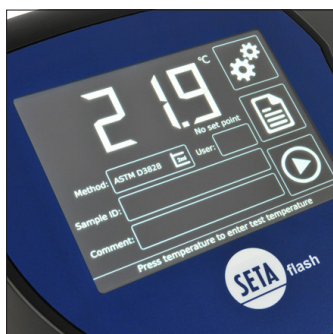
Select test temperature