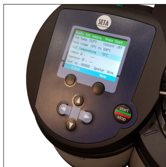
Wait for cup to reach temperature