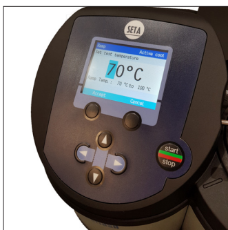
Select test temperature