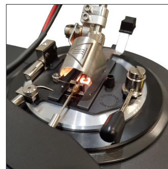
Auto dip and flash detection