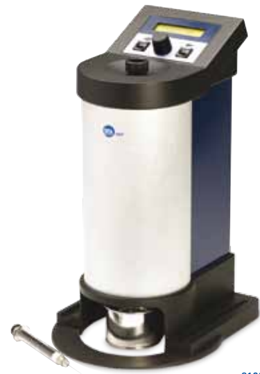
81000-2 with 81003-0