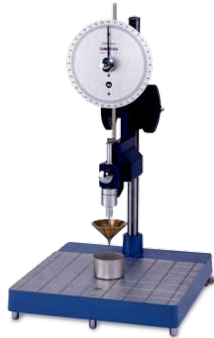
17000-2 (Cone and container supplied separately)