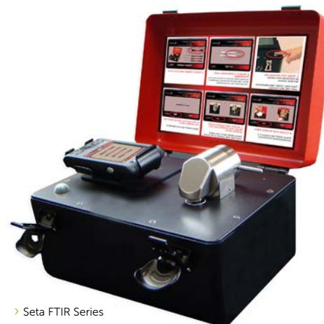
> Seta FTIR Series

Custom models can be built, please contact Seta for information.